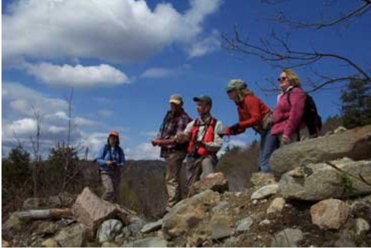
Moose Mountain hikers